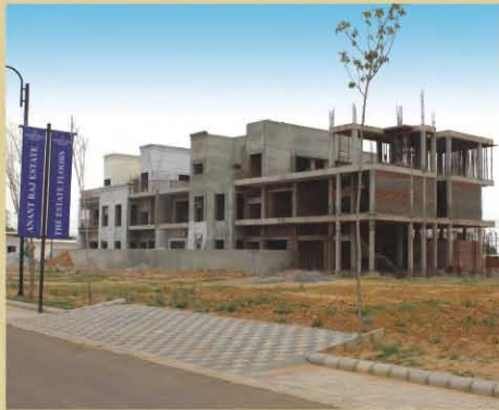
villa construction in full swing