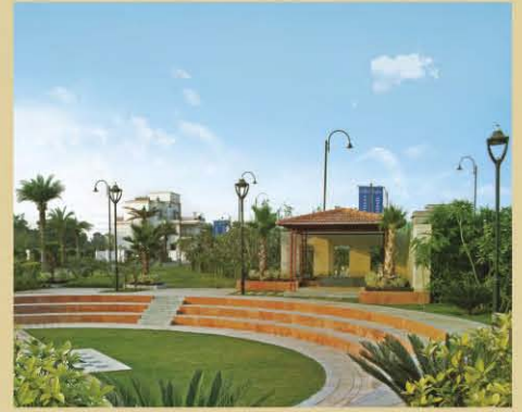
amphitheatre with manicured greens