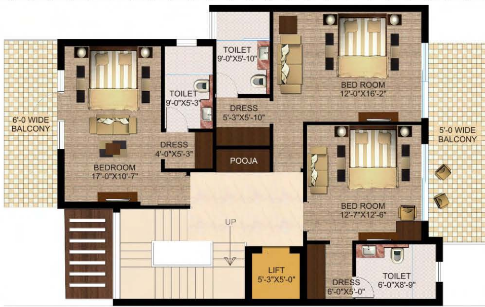
First Floor Plan (1186.823 SQ.FT.)