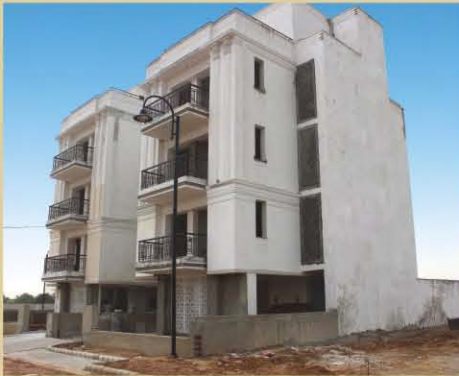
independent floor sample under construction