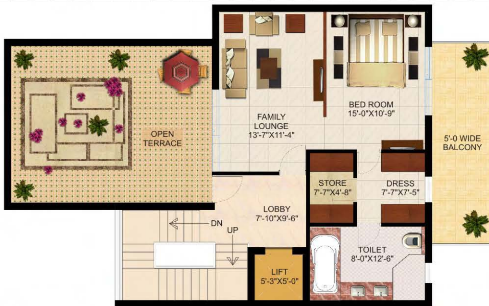
Second Floor Plan (876.046 SQ.FT.)