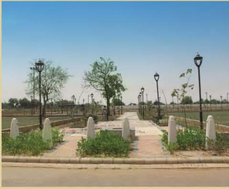
park in the making