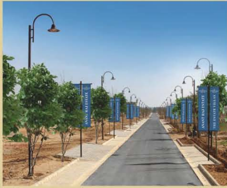
road infrastructure nearing completion