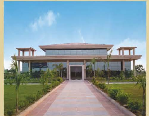
the estate prevu: sales office